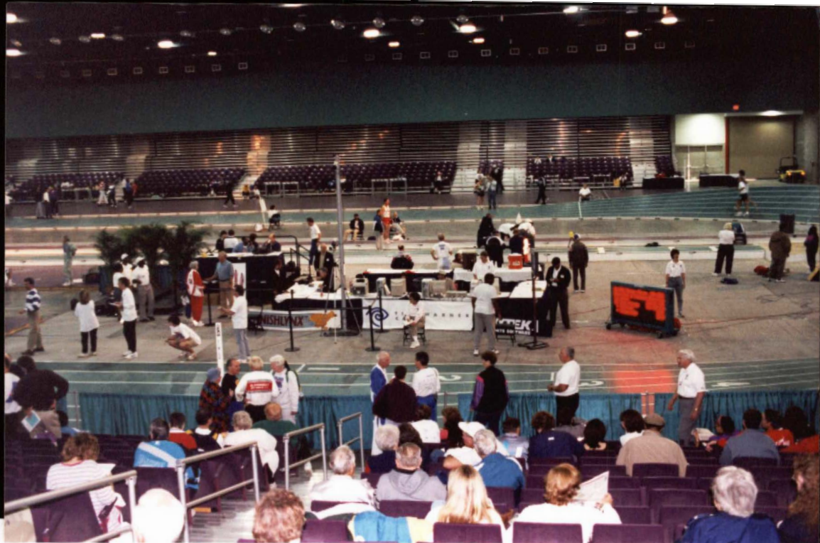
The finish line and spectator seating at the USATF National Masters Indoor Championships, Greensboro Coliseum, N.C., March 29-31.