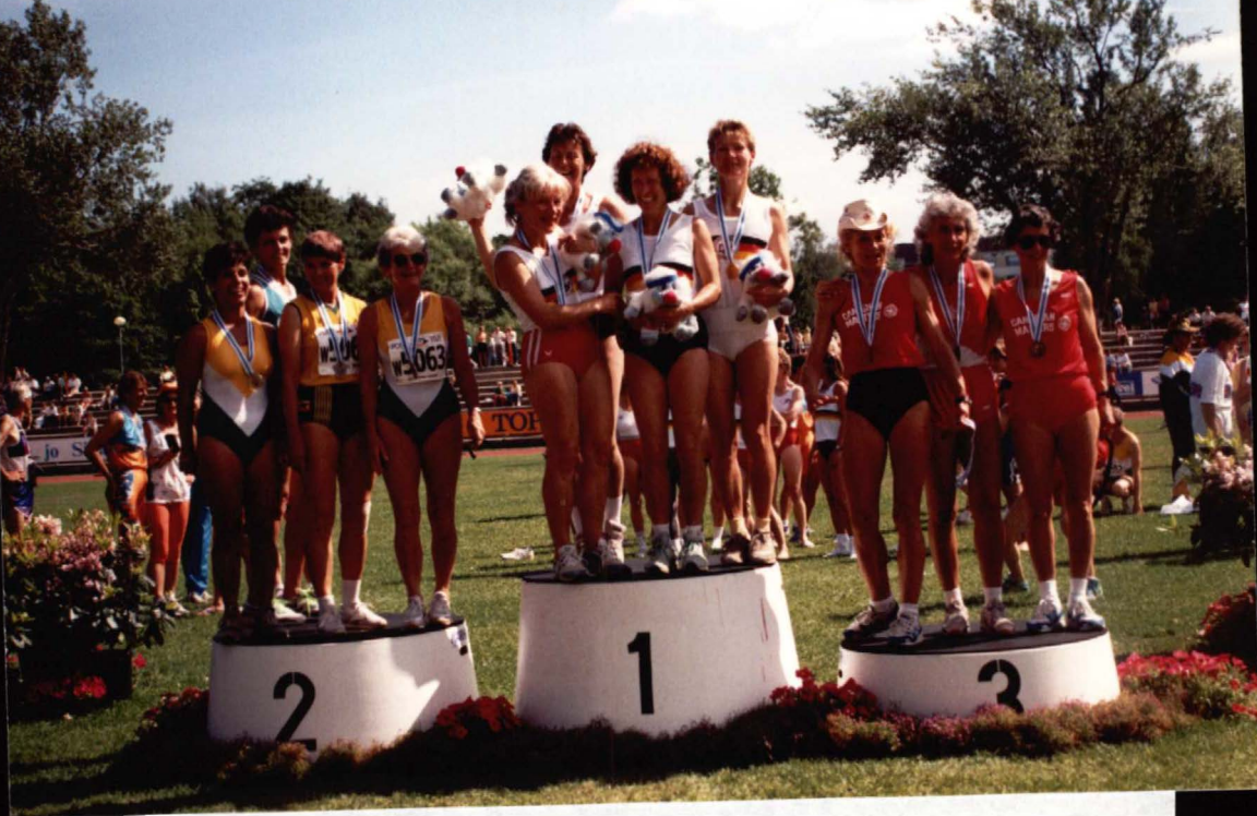
Medalists in the W45 4x100 relay celebrate on the victory stand in Turku. From left: Australia (2nd), Germany (1st), Canada (3rd).