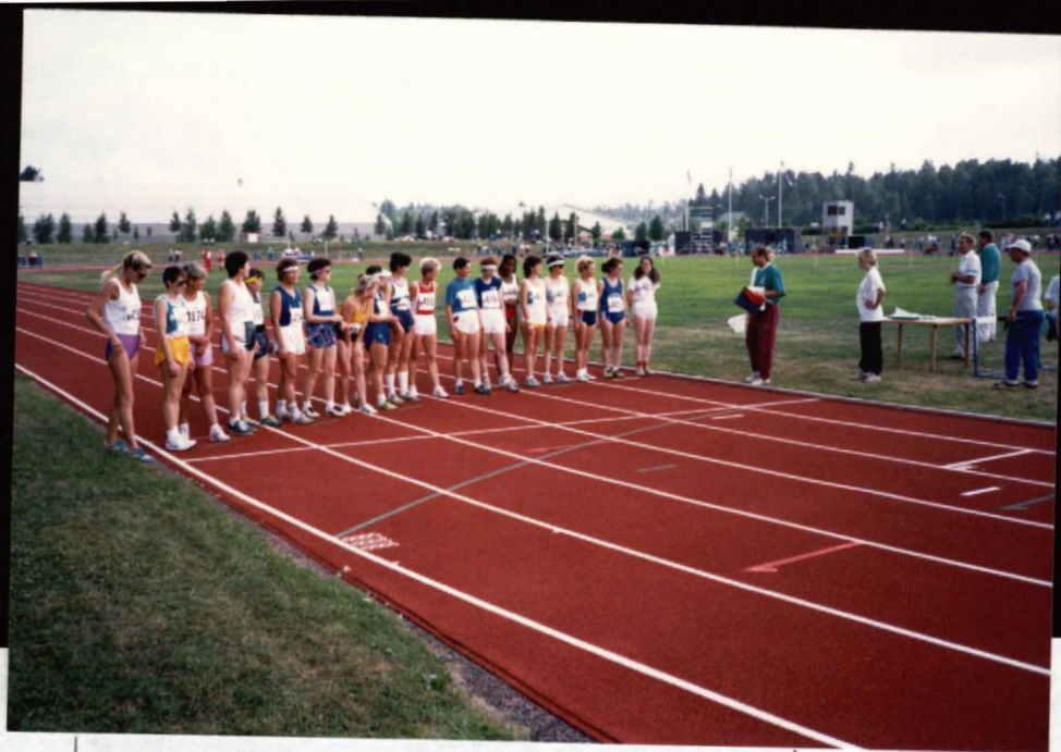
W40 walkers get set for the start of the 5K walk at Raisio Field at the World Veterans Championships in Turku, Finland.