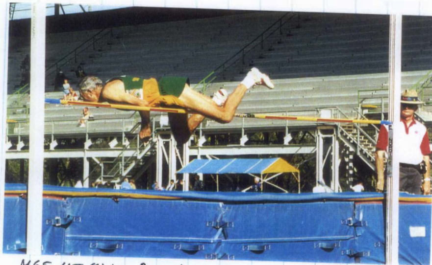
M65 HJ (6) Leo Benning RSA 1.43 / 88.8% (2)

65. INTERNAT. 1-CAL Leo Benning, RSA, sixth in the M65 high jump (1.43. 88.8%), 14th WAVA Championships, Brisbane, Australia.