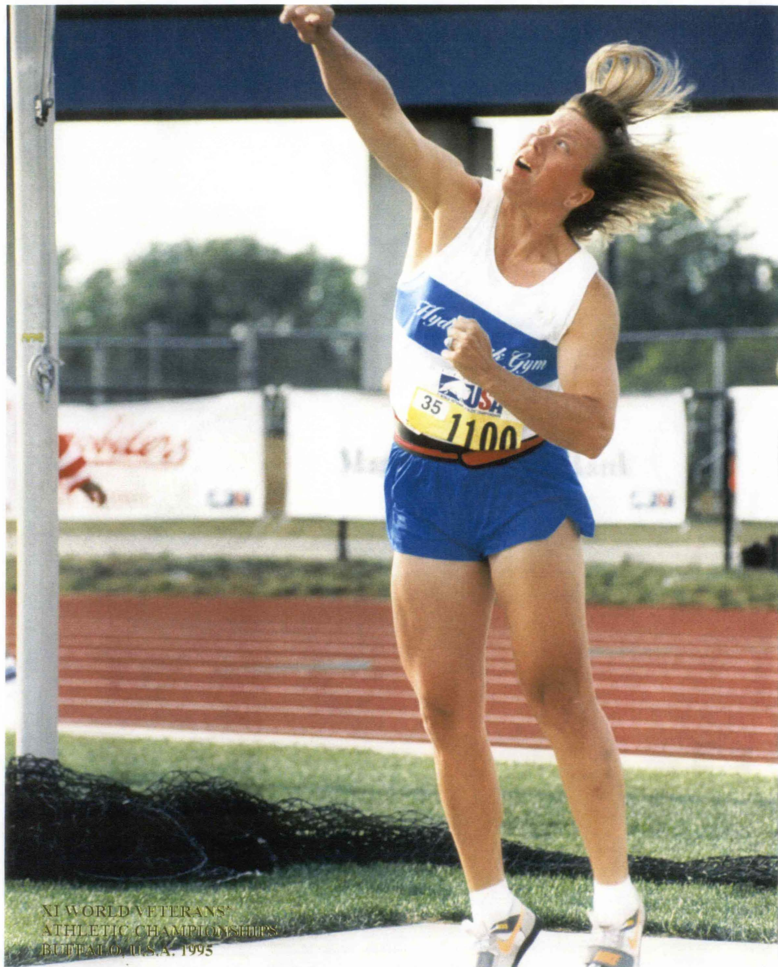
XI WORLD VETERANS' ATHLETIC CHAMPIONSHIPS BUFFALO, U.S.A. 1995