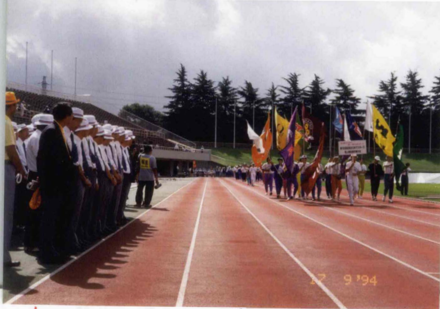
Opening ceremony of the Japan Masters Athletics Championships, Ageo City, Sept. 16-18.