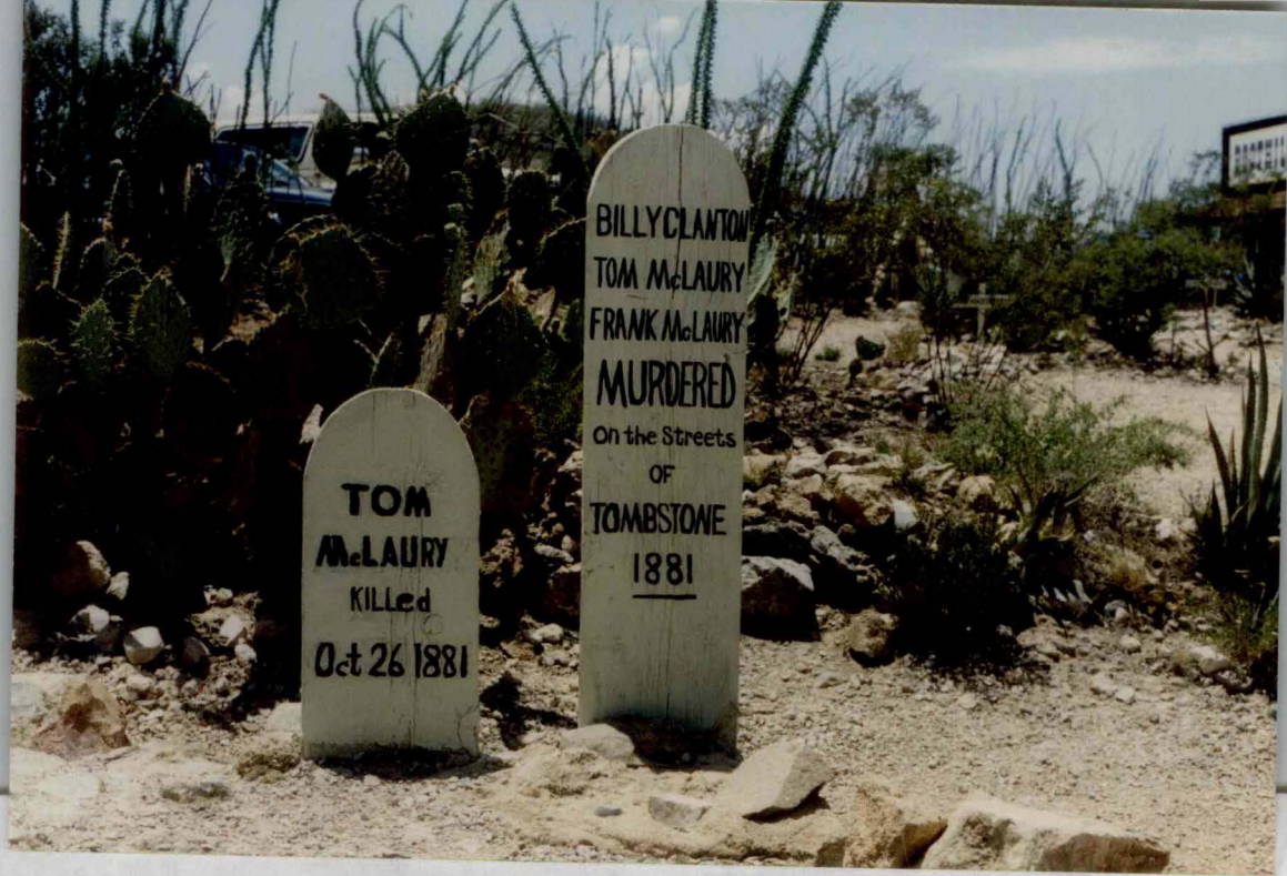
Spec a. Victims of the OK Corral shootout. No patience or Doc Holliday's shot gun?