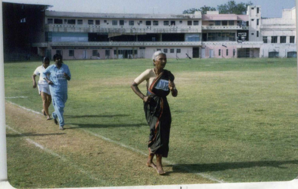
W60 20K racewalkers in three different styles of sportswear, XII Indian National Athletic Championships, at Lal Bahadar Stadium, Hyderabad.