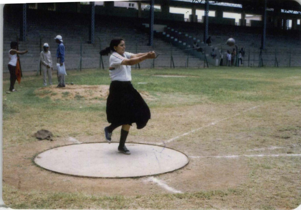
W45 hammer thrower at XII Indian National Veterans Athletic Championships, Lal Bahadar Stadium, Hyderabad.