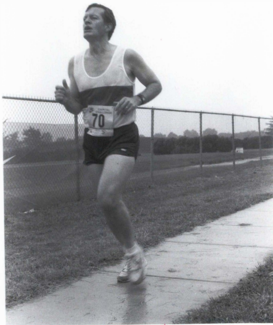
Senator Max Baucus (D-MT) repeated his victory (20:40) over the Senate contingent in the 10th Annual Nike Capital Challenge 3 Mile, Washington, D.C., September 13.