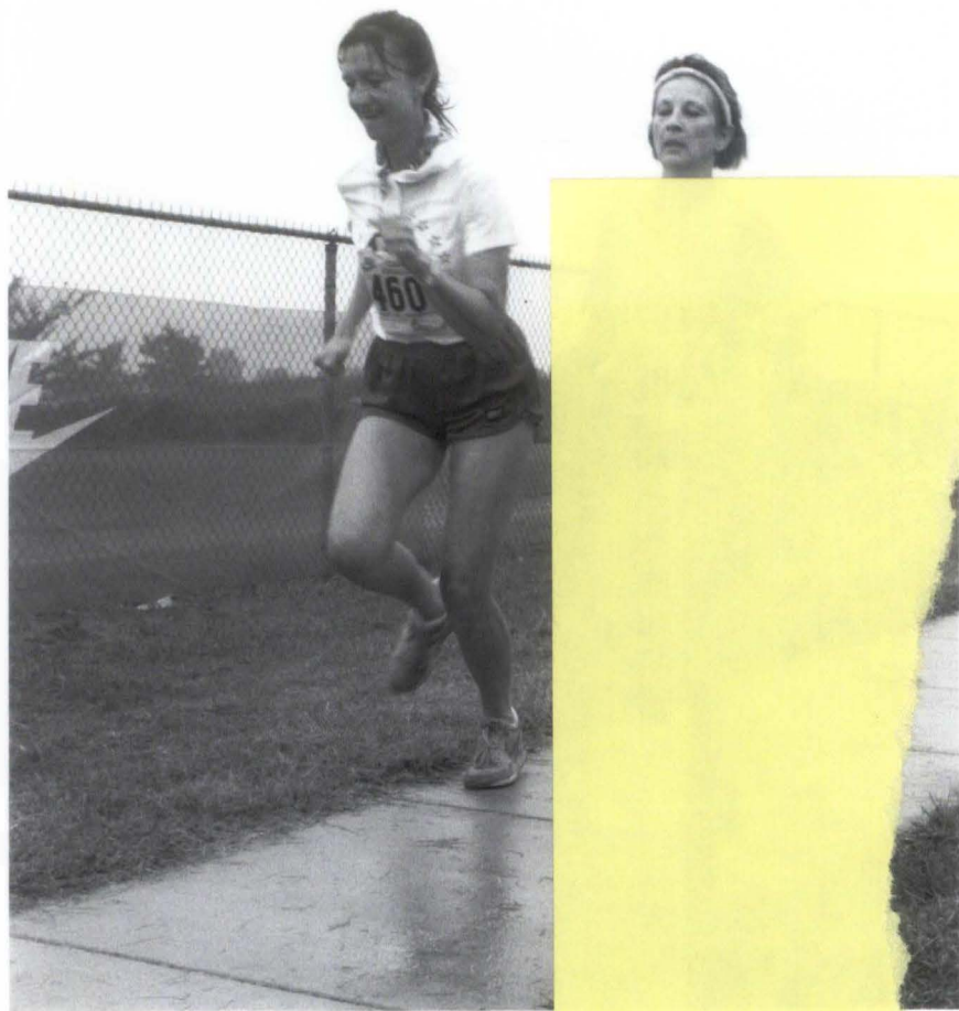
Representative Claudine Schneider (R-RI), #460, won the Female Representative division for the second time with a 27:19, 10th Annual Nike Capital Challenge 3 Mile, Washington, D.C., September 13.